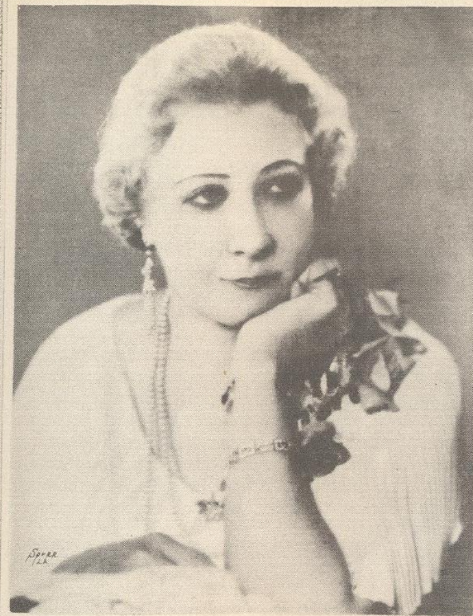
Our Beloved Messenger MRS. G. W. BALLARD